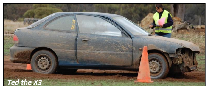
Ted the X3